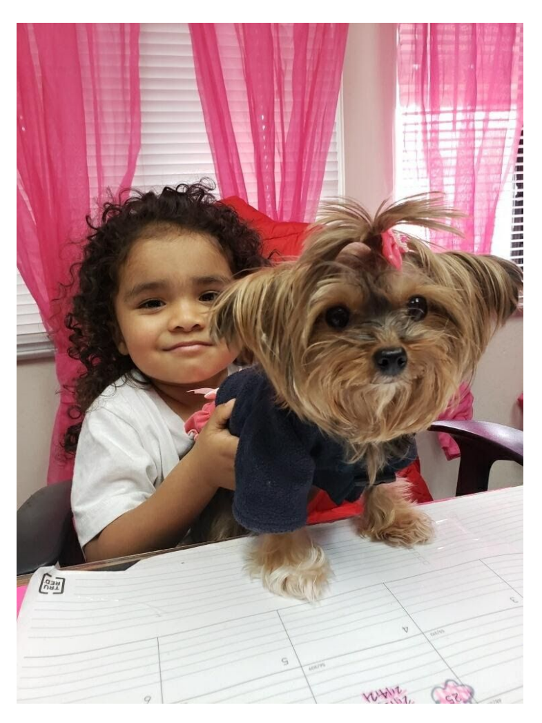
Tuffy and her brother -

BirchBark ensures stability and love for animals' families - and the critical impact that has on children - is protected